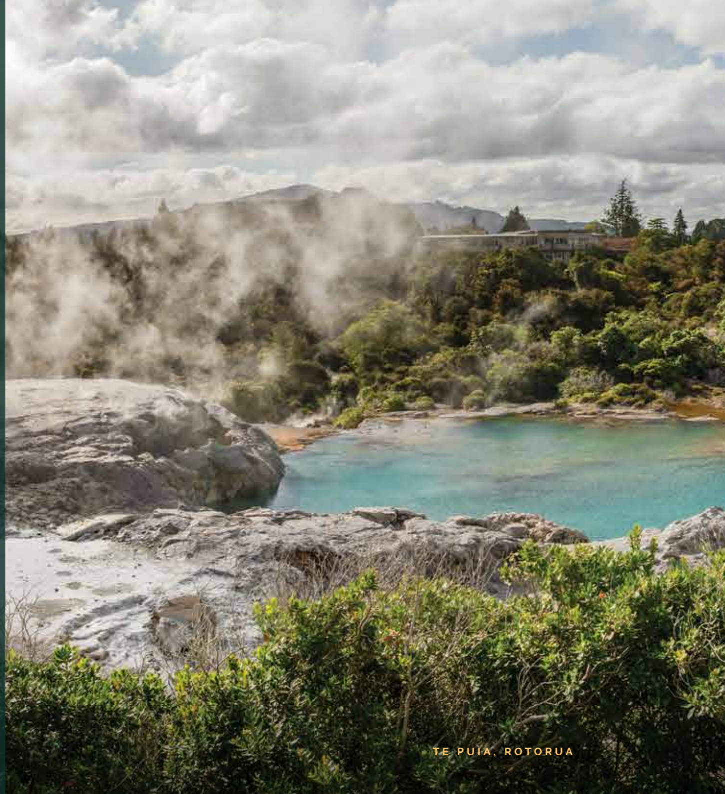
TE PUĪA, ROTORUA