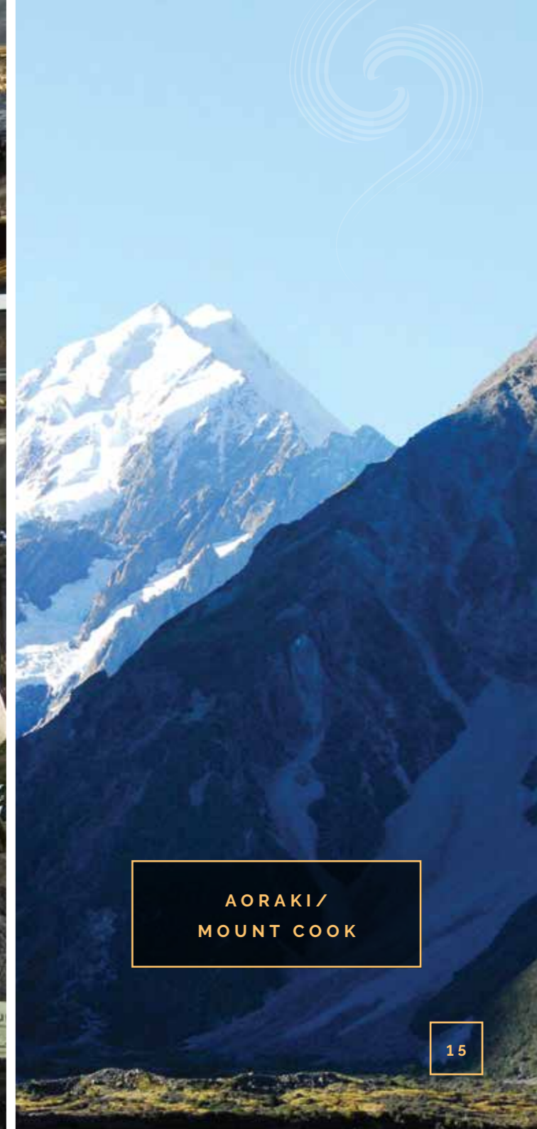
AORAKI/ MOUNT COOK