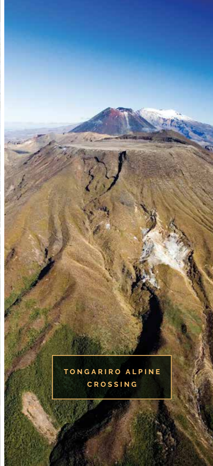
TONGARIRO ALPINE CROSSING