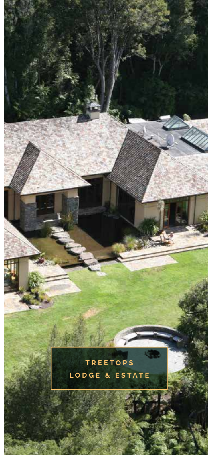
TREETOPS LODGE & ESTATE