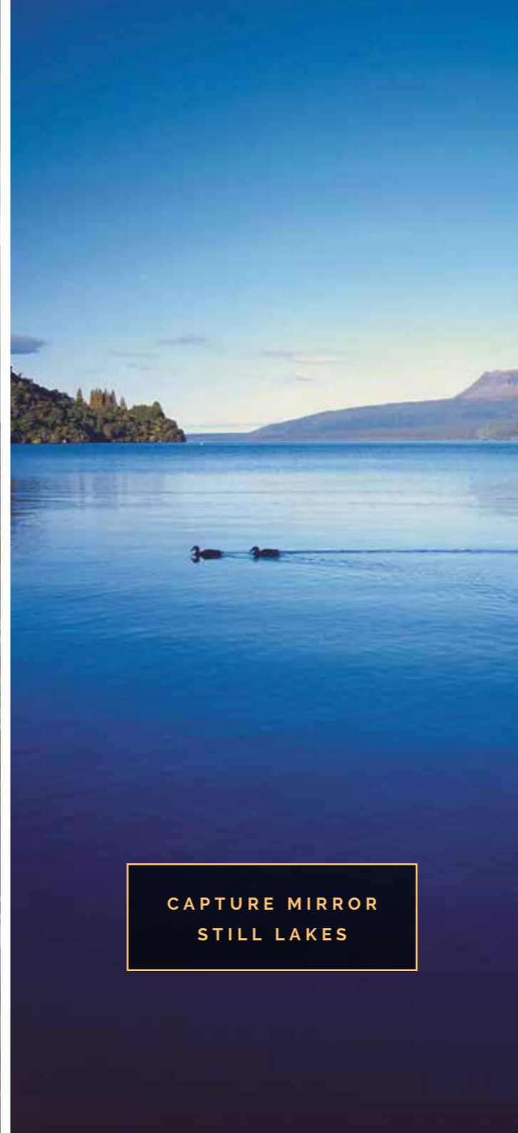
CAPTURE MIRROR STILL LAKES