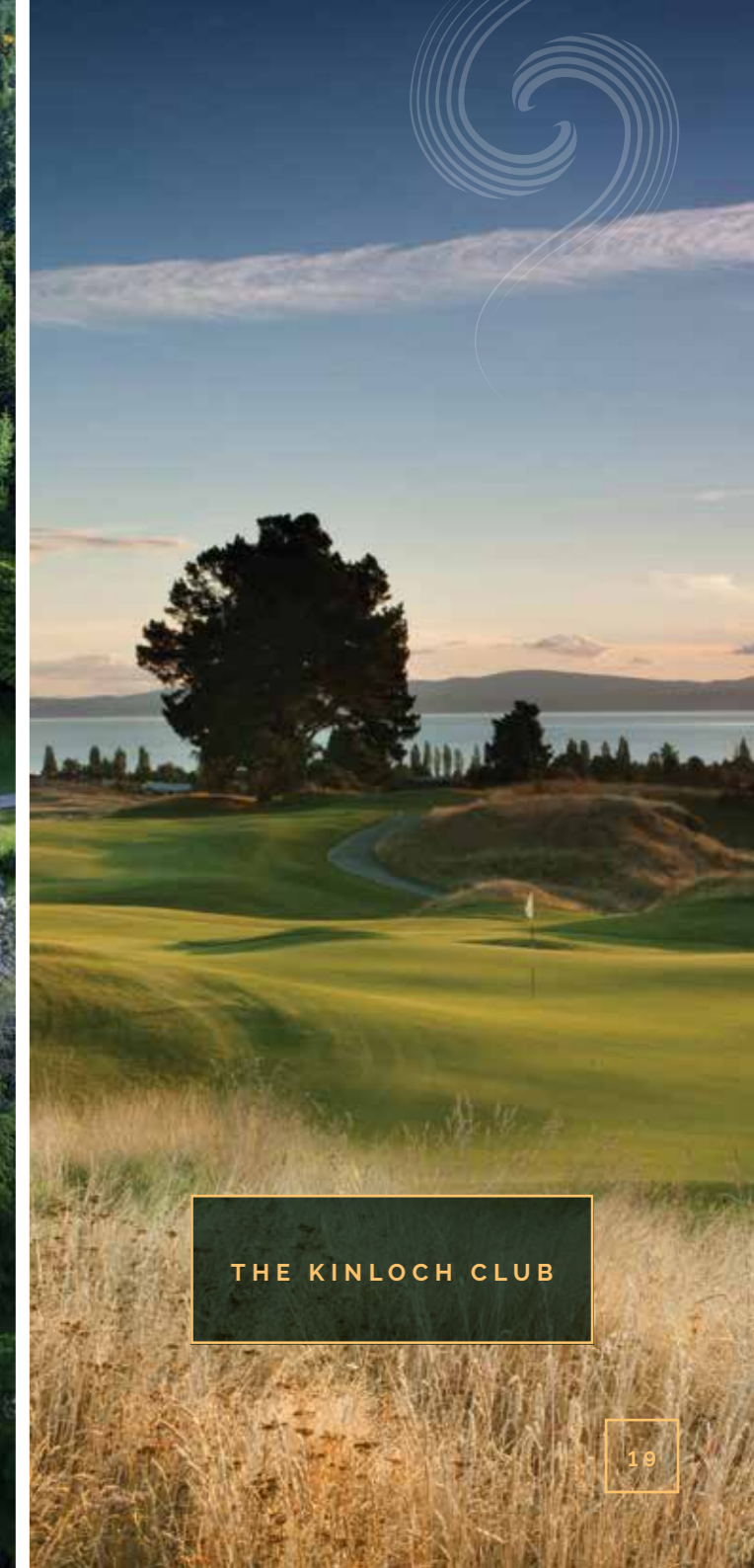
THE KINLOCH CLUB