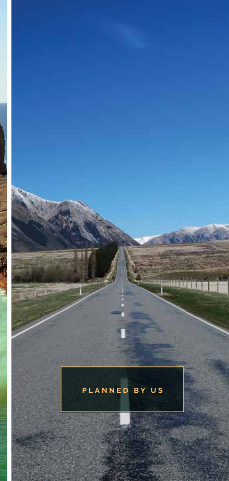
PLANNED BY US