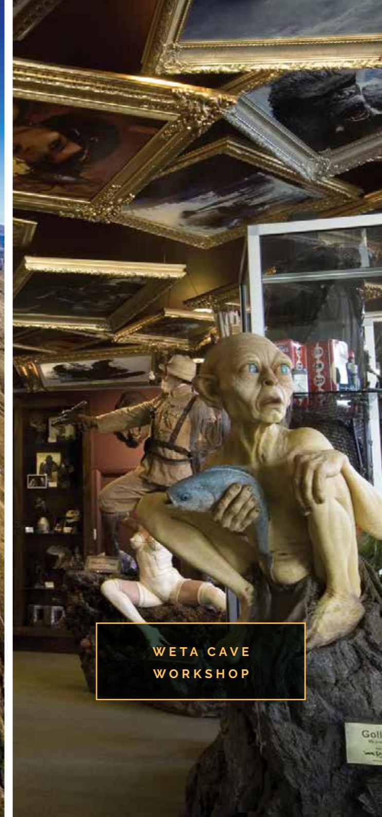
WETA CAVE WORKSHOP