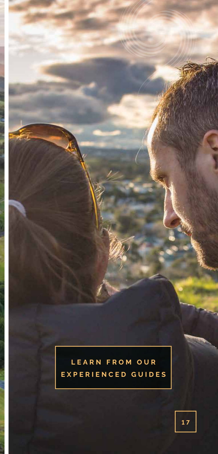
LEARN FROM OUR EXPERIENCED GUIDES