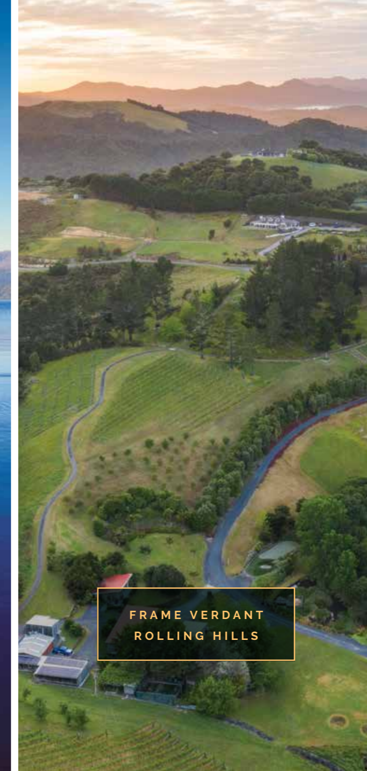
FRAME VERDANT ROLLING HILLS