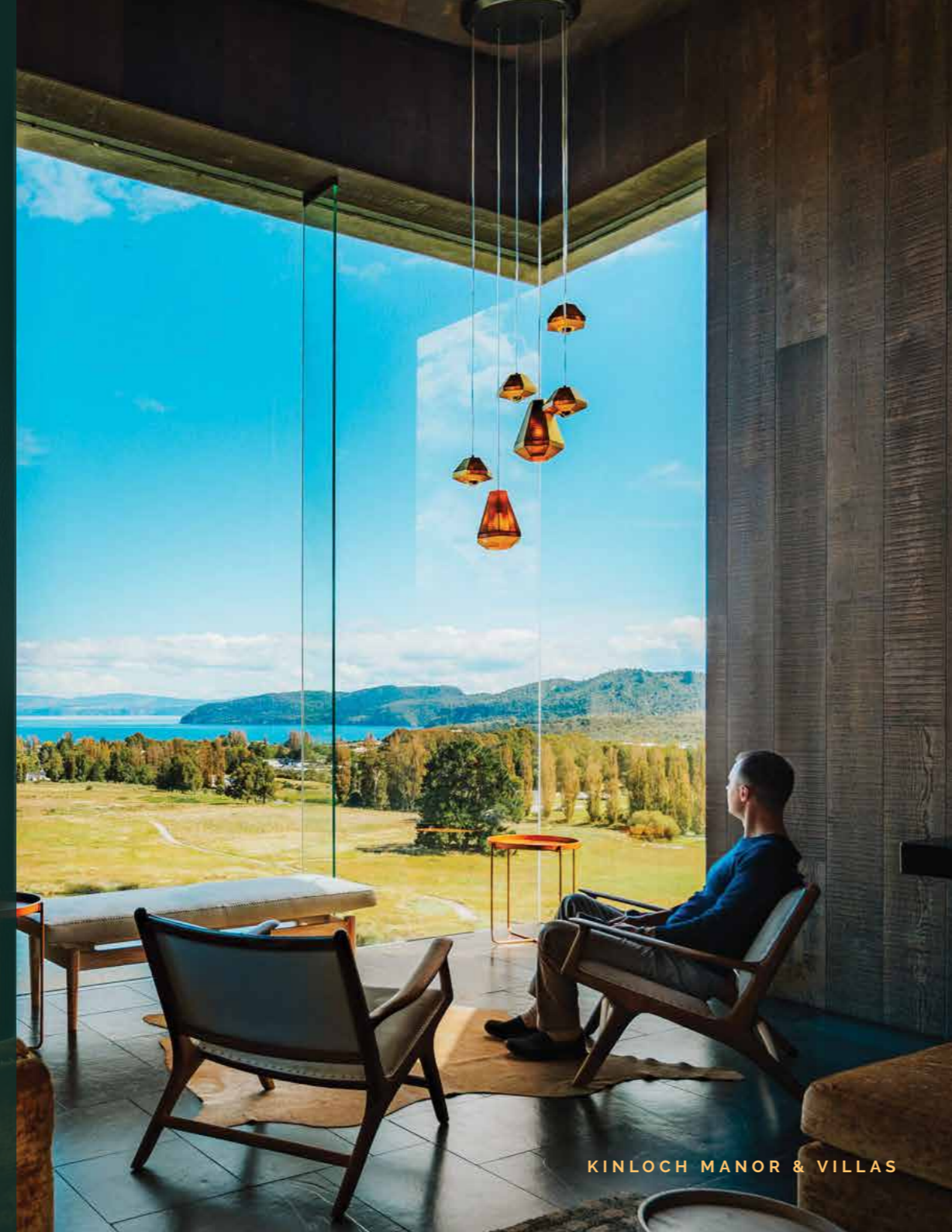
KINLOCH MANOR & VILLAS

We have connections with New Zealand's finest properties, and the experience to select those most suited to your own definition of luxury.