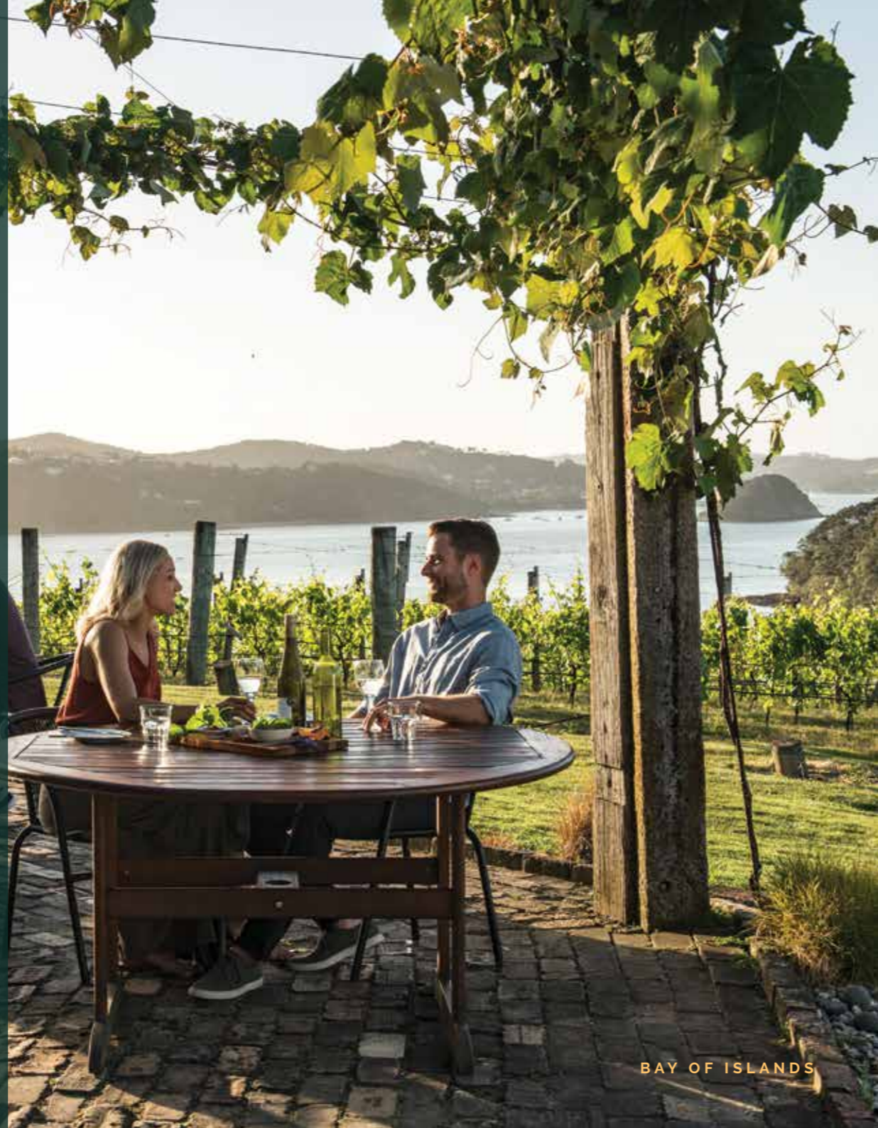
BAY OF ISLANDS

The Cuisine. Fertile lands and abundant waters shape our culinary landscape, made unique by the melting pot of cultures and culinary influences that converge here. Famed for our food, New Zealand is a hub for the globally epicurious.